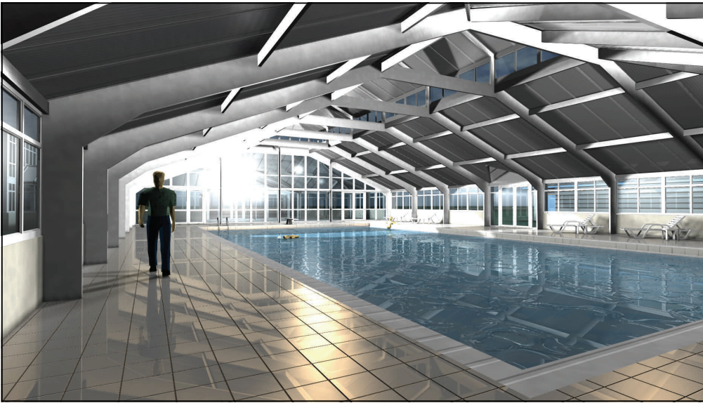
Above, architect's depiction of the exterior of The Crystal Conservatories. Below, the pool area.

With your support, seniors can benefit from swimming and aqua therapy all year long.